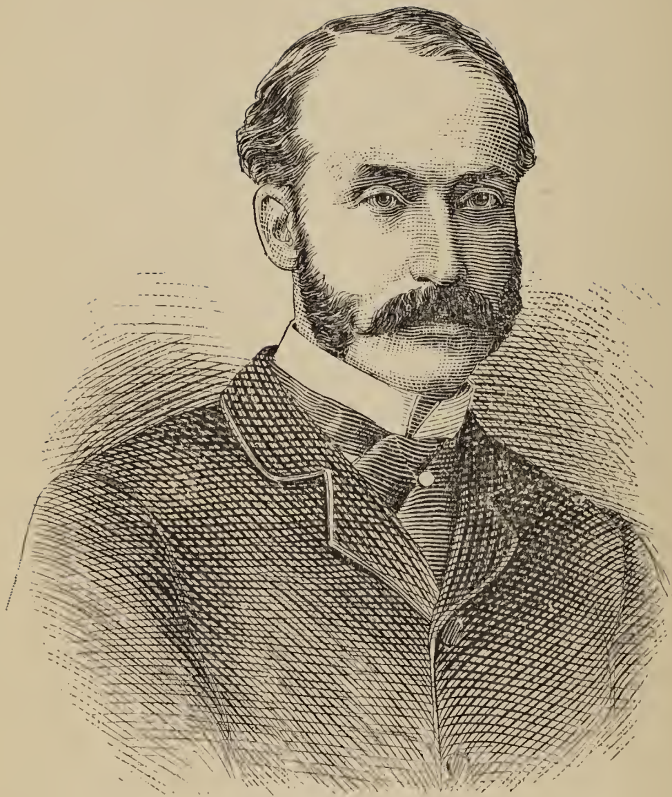
MARQUIS OF LANSDOWNE, GOVERNOR GENERAL OF THE DOMINION OF CANADA.